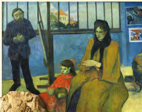
Family Schuffenecker, Gauguin, Reliquary Bust of Charlemagne, 1349, Cathedral Treasury, Aachen.

This rich art image database, available exclusively on WilsonWeb, now offers more than 155,000 works from an impressive roster of distinguished international museum sources.