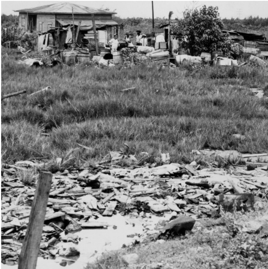
Photo 3: [Shack on plot close to Constitution Bridge] El Mundo , August 19, 1953. Bottom of photo: Makeshift homes. Shacks shoot up close by Constitution Bridge. Multiple views of the shacks that still remain.