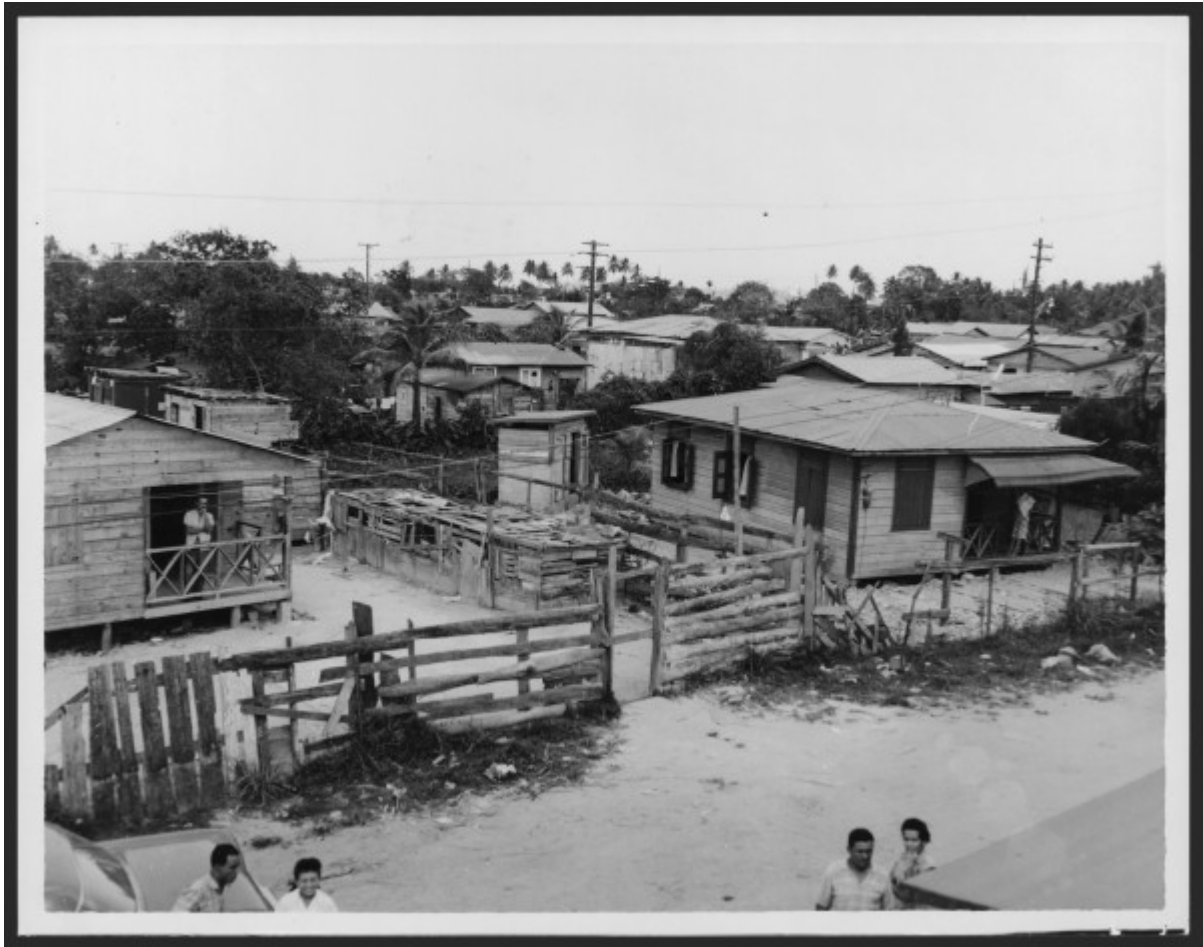
Photo 4: [Residential area of the Juana Matos slum in Cataño] Marshland converted into residential use El Mundo , March 12, 1960, p. 22