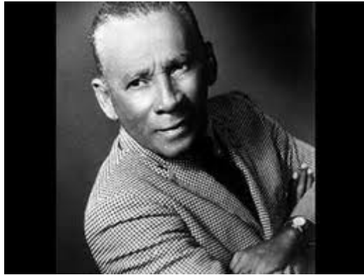
Rafael Hernández ( El Jibarito ; 'The Rustic Man')

He was born in Aguadilla, Puerto Rico, in 1891 and died in 1965. He participated in World War One and later settled in Harlem, New York. During the war he was a musician in the military band "Harlem Hellfighters", made up entirely of blacks. He was a composer and a musician, and he is considered one of the most important characters in the Latin American music of the time. In 1929 he composed a song titled " Lamento Borincano " (Puerto Rican Sorrow) at a restaurant in Harlem, New York, which was about the misery and hopelessness of the Puerto Rican people.