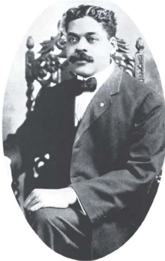
Arturo Alfonso Schomburg