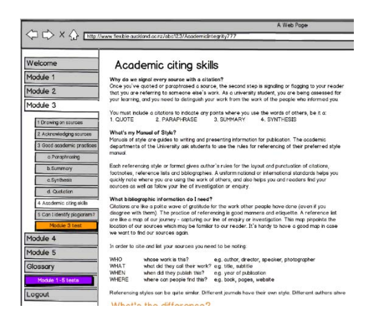
Paper prototype using Balsamiq

Four students were invited to participate in the paper prototype usability testing. They were asked to complete several tasks by navigating the paper site. These tasks include: